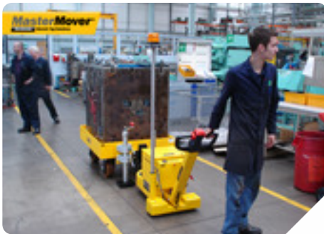
Machine: MT10/560 Business Type: Plastic and Metal Extrusion