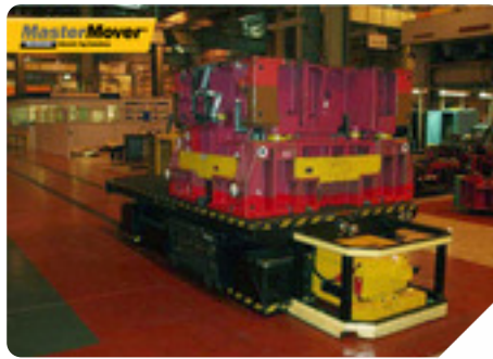
Machine: MT20/1500 Business Type: Automotive and Commercial vehicles