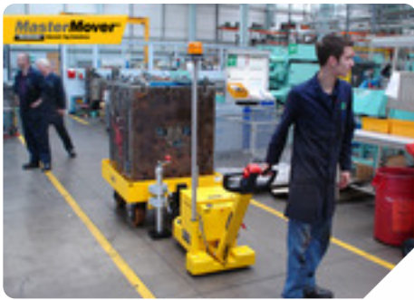
Machine: MT10/560 Business Type: Plastic and Metal Extrusion