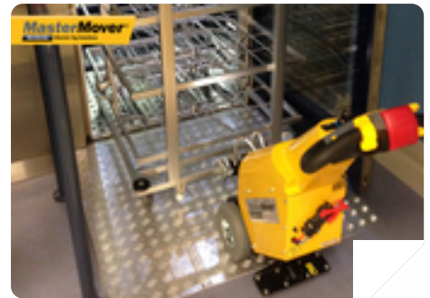
Machine: SM100+ Business Type: Healthcare Client: Wesley Hospital