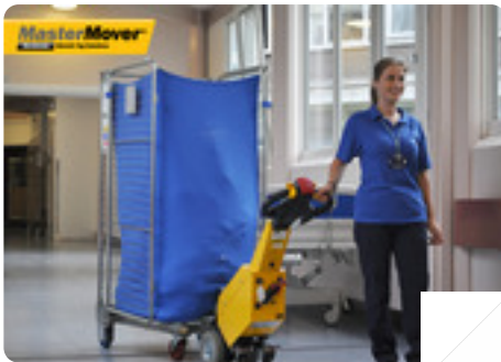
Machine: SM100 Business Type: