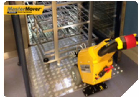
Machine: SM100+ Business Type: Healthcare Client: Wesley Hospital