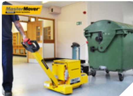
Machine: MT3/240 Business Type: Healthcare