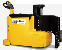
MT1000+ Moves up to 22,000 lbs.