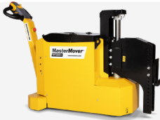
MT300+ Moves up to 6,600 lbs.