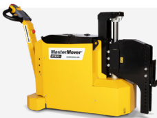
MT400+ Moves up to 8,800 lbs.