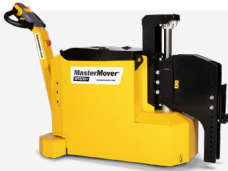
MT600+ Moves up to 13,200 lbs.