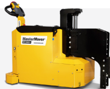
MT1500+ Moves up to 33,000 lbs.