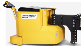
MT2000+ Moves up to 44,000 lbs.