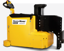
MT1200+ Moves up to 26,400 lbs.