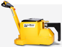
MT200 Moves up to 4,000 lbs.