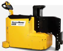
MT800+ Moves up to 17,600 lbs.