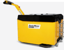
TOW1200 ES Moves up to 26,400 lbs.