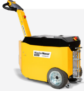
TOW300 Moves up to 6,600 lbs.