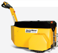
TOW800 ES Moves up to 17,600 lbs.