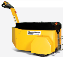
TOW600 ES Moves up to 13,200 lbs.