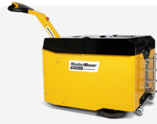
TOW1000 ES Moves up to 22,000 lbs.