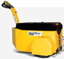
TOW600 Moves up to 13,200 lbs.