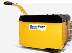
TOW1500 ES Moves up to 33,000 lbs.