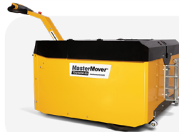
TOW2000 ES Moves up to 44,000 lbs.