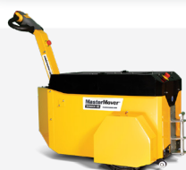
TOW600 Moves up to 6,000kg