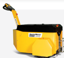
TOW600 ES Moves up to 6,000kg