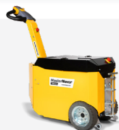
TOW300 Moves up to 3,000kg