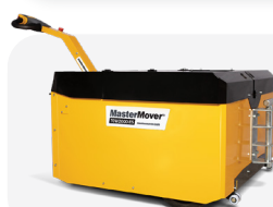
TOW2000 ES Moves up to 20,000kg