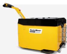
TOW1000 ES Moves up to 10,000kg