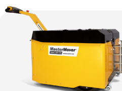
TOW1500 ES Moves up to 15,000kg